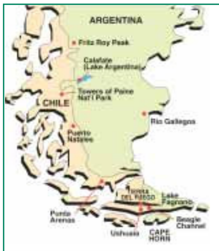
explora™ en Patagonia

Sail the main branch of the Beagle Channel. Disembark at the Bay of the Günter Plushow Glacier and hike near the glacier. After this unforgettable experience, you will continue navigating through O'Brien and Ballenero Channels, Bahía Desolada, Paso Aguirre and Cockburn Channel. (B, L, D)