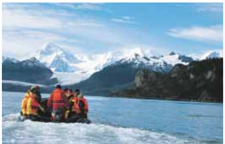
Exploring the Pia Glacier on the Australis cruises