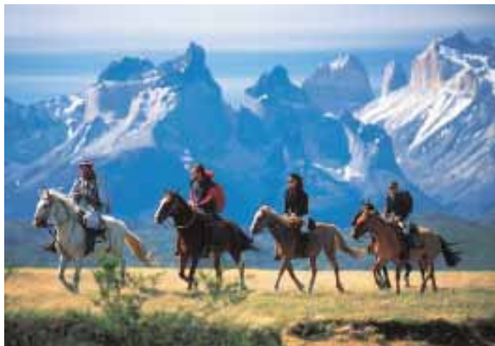
The magnificent Towers of Paine, Paine National Park, Chile

Day 12, Fri or Mon: Perito Moreno Glacier Tour Today you will take an exciting, scenic tour of the Perito Moreno Glacier. Depart early in the morning via motorcoach for the Magellan Peninsula, and continue to the cliff overlooking the glacier. You will have several hours to explore this great natural wonder from many different perspectives. This is the only glacier in the world that is still growing, and it encompasses an area larger than cosmopolitan Buenos Aires. The deep blue color of the ice is