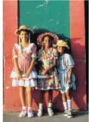
The many colors of Brazil

Note: EcoAdventures charges an additional $50 per person handling fee.