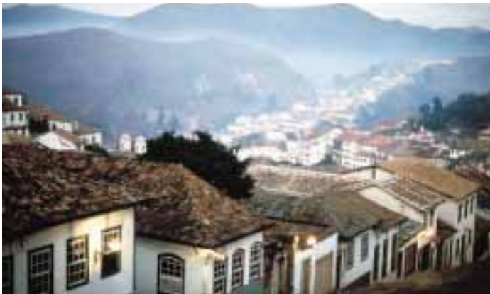
Dawn over Ouro Preto