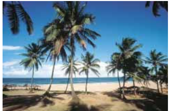
Pristine beaches of Recife

Note: Rates are not valid during New Year's Eve, Carnival or Easter Week.