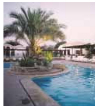
(Right) Inviting pool at Las Dunas Hotel in Ica