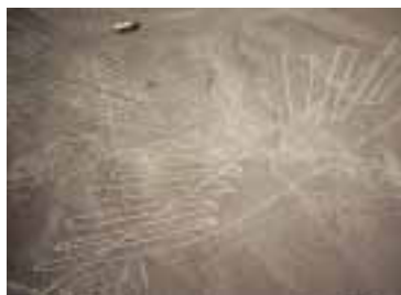
Giant ground drawings, Plains of Nazca

Rates Include: Hotel accommodations, tax, service, continental breakfast, round-trip hotel/bus station transfers, round-trip bus to Ica via Royal Class tourist service and overflight of the Plains of Nazca from the Las Dunas airstrip.