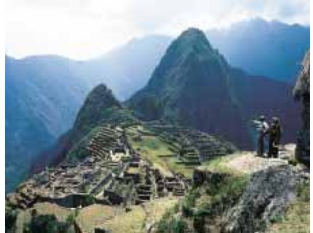
Approach Machu Picchu from the Royal Gate overlooking the citadel

Important Note: For the adventurous, the trek to Machu Picchu is an exhilarating experience filled with incredible views of the Andes. You will never forget camping at remote Inca tambos (way stations) and walking on the same trail as Inca messengers did centuries ago. The extremely high altitudes of the trek (Cuzco at 11,300 ft. and one pass at over 13,500 ft.) make preparation an imperative, which is why we include three nights in Cuzco for acclimation prior to the trek. This extra time in Cuzco is sufficient for most people and considered a minimum, unless you live at 5,000 feet altitude or more. There are important factors to consider if you are contemplating an Inca Trail Trek, such as age and overall fitness. You should also prepare at least one month in advance with a regimen of rigorous hiking for five miles three times a week. However, none of these factors hasten acclimatization. Only time matters. As a general rule you need one day for each 1,000 feet over 10,000 feet altitude. Without this, the result is soroche , or altitude sickness, which causes mild to severe flu-like symptoms and can ruin your trip. After proper acclimatization, people are thrilled as they complete the final steps of the trek, enter the Royal Gate at the very top of Machu Picchu, and marvel at the grandeur of the sacred site below.