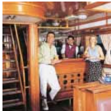
Classically beautiful all-teak interiors