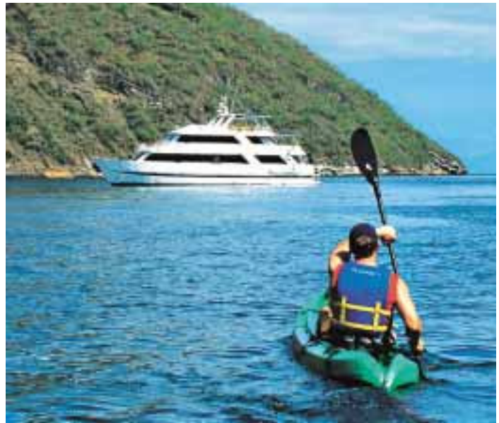
Dolphin Deck Cabin (left) Discover Galapagos via sea kayak (above)

Thanks to the small group size, your expedition to the Galapagos can be at a much more leisurely pace. Snorkeling equipment, wet suits and sea kayaks are provided at no additional charge.