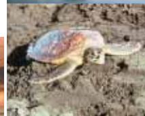
Tortuguero Peninsula Sea turtle nesting and bird watching at Tortuguero Beach