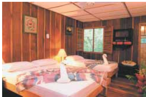
Standard Room at Mawamba Lodge