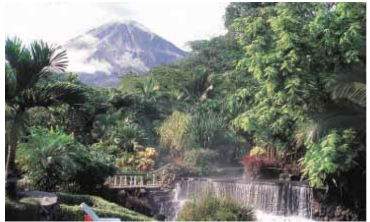
Arenal Volcano & Tabacon Hot Springs Resort

Package Rates Include: Transfers via shuttle service with driver between Peace Lodge, Arenal, San Jose or Monteverde; accommodations in selected hotel for two nights, and hotel tax & service.