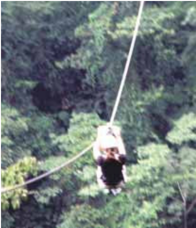
From Hanging Bridges to white water rafting, river floats, zipline tours for thrill seekers, exotic wildlife viewing for nature lovers - it's all there in Costa Rica!